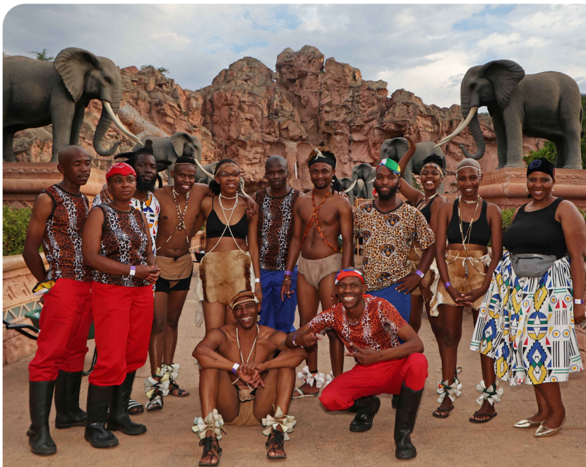
Gearing up for the Beach Party.