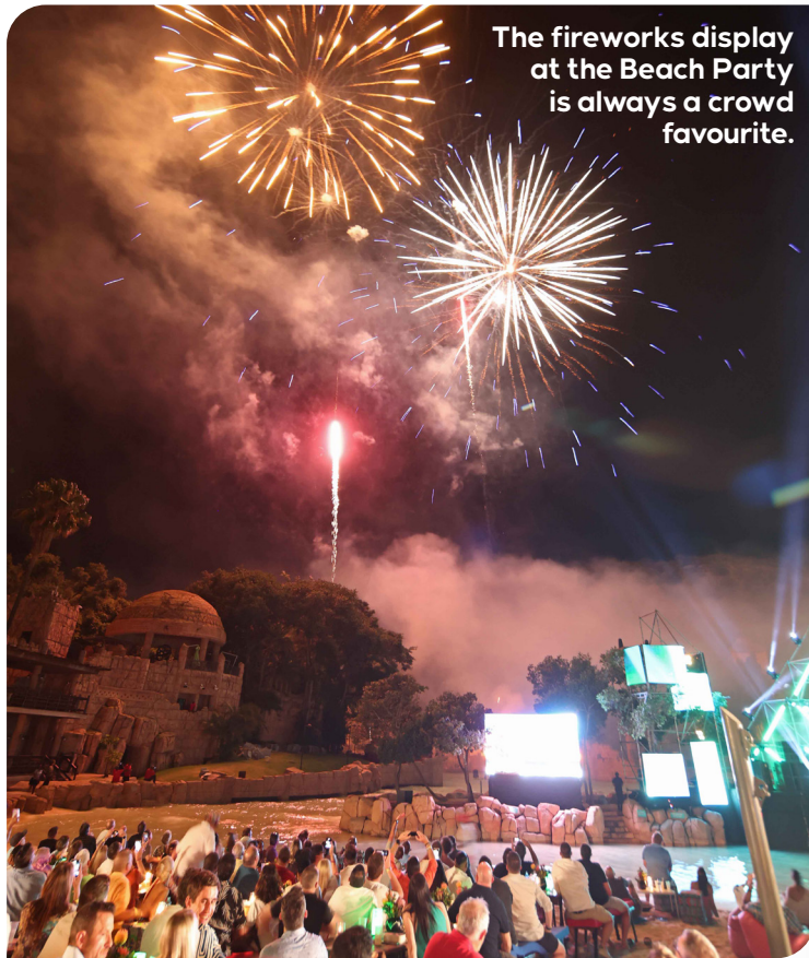
The fireworks display at the Beach Party is always a crowd favourite.

Sun City has once again crept into the hearts of the players at this year's Nedbank Golf Challenge.